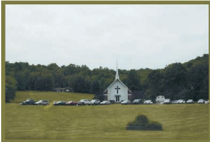
"Christians" attending services on their Sabbath -- Sunday.

As our loving Father, YEHOVAH wants to give each of us His greatest gift of all -- ETERNAL LIFE -- glorious, eternal "rest" in the