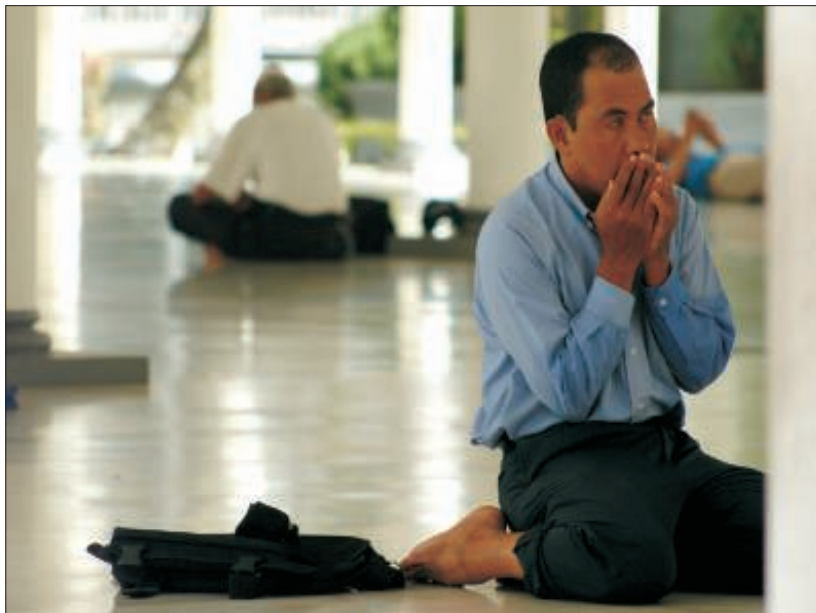
Moslems praying in a mosque on their sabbath day -- Friday.

Because Abraham continued in this OBEDIENT relationship with YEHOVAH God ( Genesis 26:5 ), YEHOVAH promised him the greatest and most abundant blessings imaginable -- this WHOLE EARTH for an inheritance, SONSHIP IN YEHOVAH'S FAMILY, and ETERNAL LIFE with which to enjoy it!