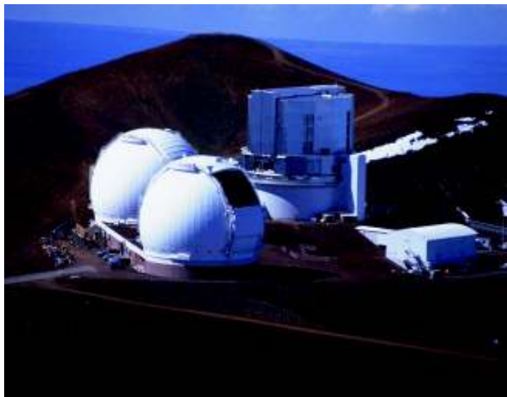
The twin Keck telescopes on Mauna Kea, Hawaii. These gigantic 394" telescopes inside dome-shaped buildings reveal but a FRACTION of YEHOVAH's infinite power and glory!

10. Is YEHOVAH TRUTHFUL? Titus 1:2 . LOVING? I John 4:8 . JUST? Deuteronomy 32:4 . MERCIFUL? Psalms 136:4 .