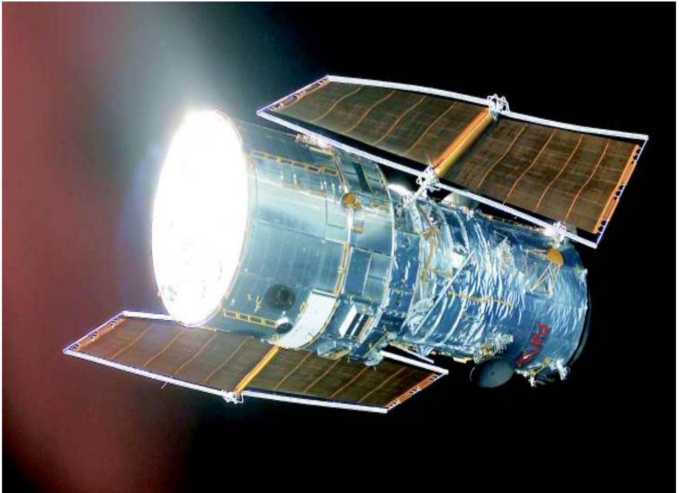
The Hubble Space Telescope