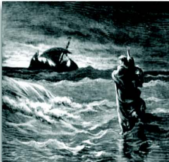
The Messiah walked on water by means of the energy of the spirit of YEHOVAH God!

1. Was King Solomon the wisest man who ever lived because YEHOVAH GOD gave him wisdom? I Kings 3:11-12; 10:24 . Then is the God Kingdom ALL-wise -- the SOURCE of