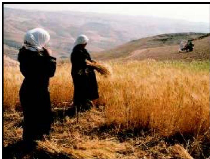
Grain harvest pictures the "wheat" of Yeshua's parable which is to be gathered into YEHOVAH's Kingdom.

5. Did Yeshua also compare the evil to tares -- weeds which are a menace to the good? What are Yeshua's own words concerning his gathering of his wheat -- the good -- and the burning of the tares -- the evil? Matthew 13:30 . Also scan quickly the rest of this parable, beginning with verse 24 . Did Yeshua elaborate on what the symbol" of this parable represent? Matthew 13:36-42 .