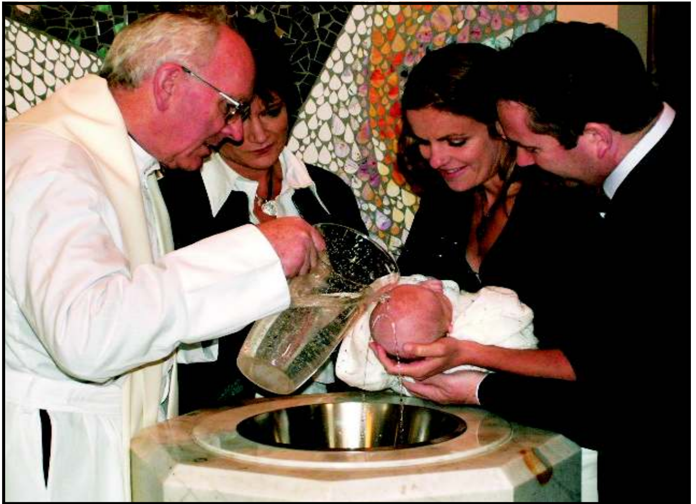
“Baptizing” an Infant