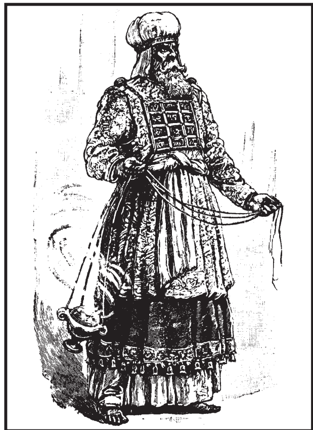
High Priest with Censer

COMMENT: These themes are found in the SEVEN TRUMPETS which are found in the setting of the offering of incense at the golden altar together with the PRAYERS of the saints.