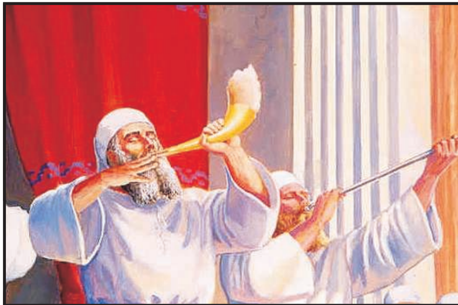
The Shofar -- a trumpet made from a ram's horn -- was anciently used as an instrument of warning.

Trumpets comes as the CLIMAX of a seven-month series of MINI-FEAST OF TRUMPETS!