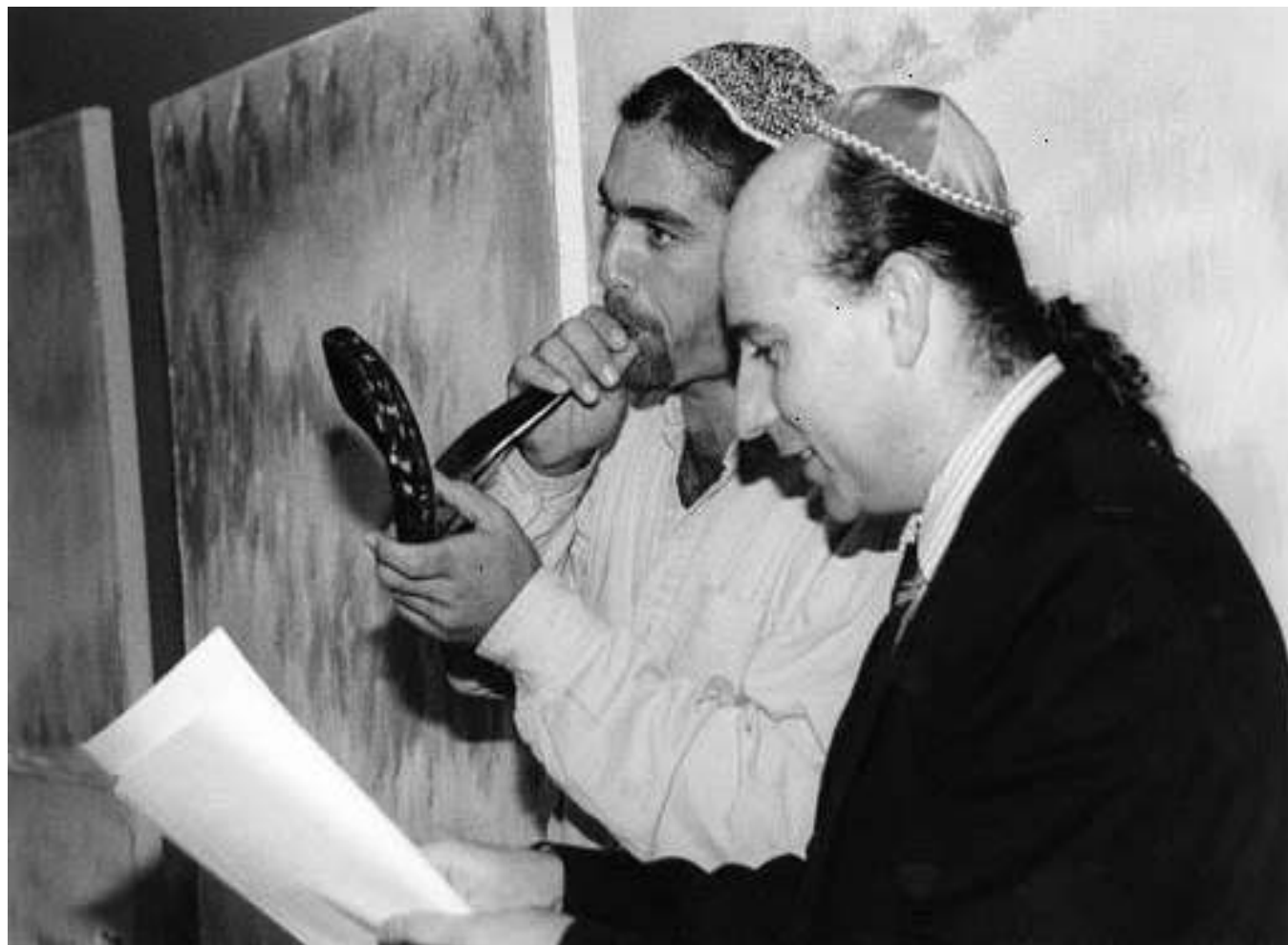
Blowing the Shofar at Synagogue Service

The Feast of Trumpets -- Return and Enthronement of YEHOVAH God and His Messiah!